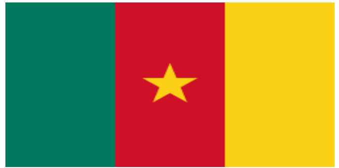
The Flag Of Cameroon