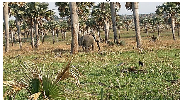
A Single Younger Elephant Running Into The Beautiful Forest In Uganda