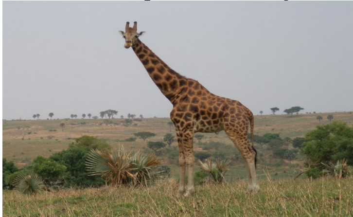
God's Beautiful Creation In Uganda!