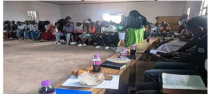
A Peace And Reconciliation Conference After The Terrorists Took Over Goma