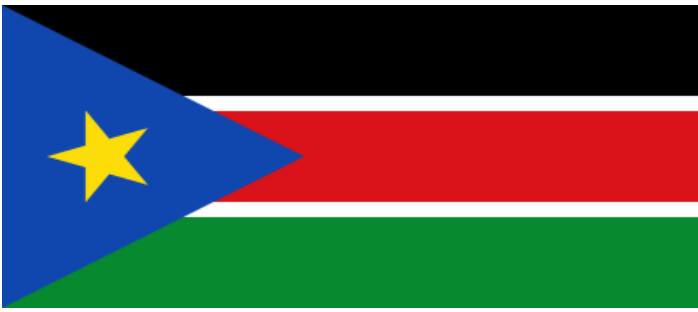
The Flag Of South Sudan