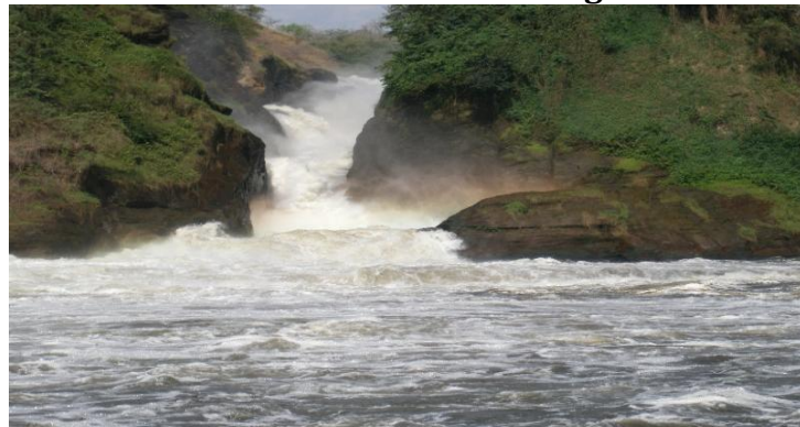
The Fast Bujagali Falls On The Nile River In Beautiful Uganda