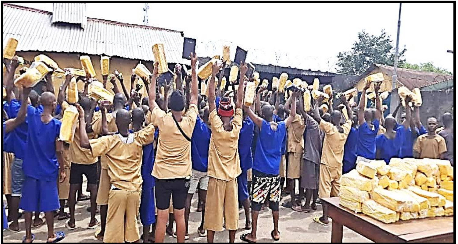
GIMI Giving Prisoners in Sierra Leone Physical Bread and the Bread of Life.