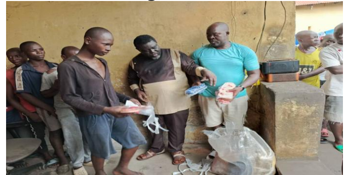
GIMI Pastor Giving Prisoners Rubber Sandals