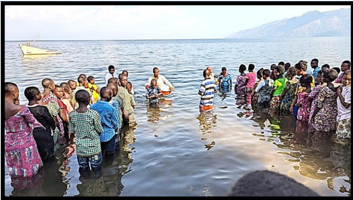
Large Baptism in Lake Kivu in the DR Congo