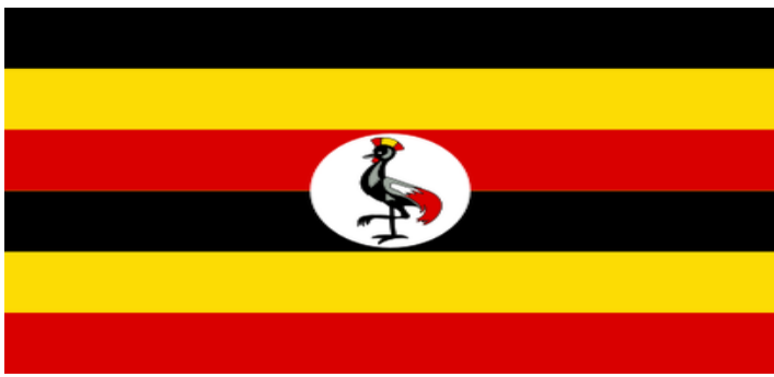
The Flag Of Uganda