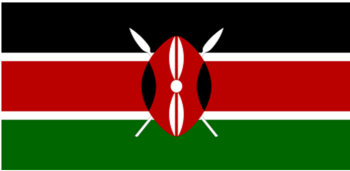
The Flag Of Kenya