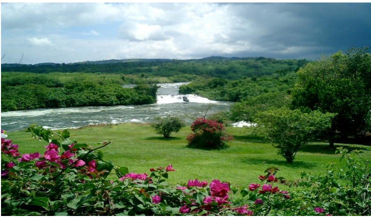
The Beautiful Nile River Photo Taken In Uganda On A Past Trip