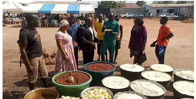
GIMI Providing Large Meals For Prisoners