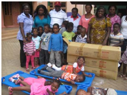
Childrens cots donated by Reimer Road Baptist Church in Ohio