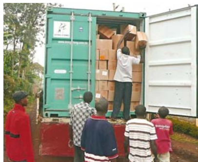
Unloading a container of Bibles in Nairobi, Kenya