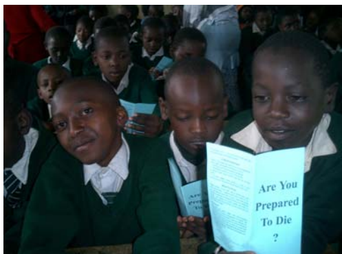
School children in Uganda reading Gospel tracts given by GIMI