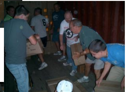
A big "THANK YOU" to everyone that helped load the container.