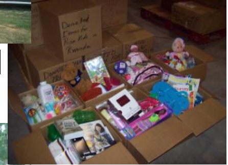
Prison kids boxes.