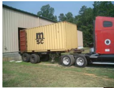
Container ready for Africa.

And, before moving on in this article, let me ask you to please take a look at the photos in this newsletter of some of our wonderful volunteers who recently helped us to load this container. There is just no way that we could ever get done all that we do without so many volunteers stepping up and helping us. Volunteers, thank you from the depths of my heart for your tireless labor for the Kingdom of God! We love and appreciate you so much!